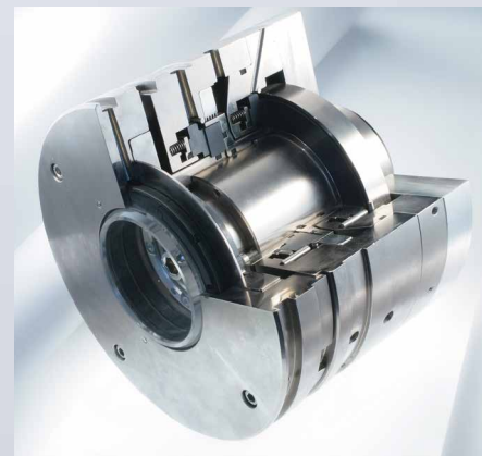
A typical design of a Dry Gas Seal

Design modifications such as narrow gaps and a labyrinth on the product side of the seal generate turbulent flows. The resulting fluid friction encourages a build-up of heat - and heat is also generated at the seal faces. The smaller the sealing gap, the less the leakage but the more heat is generated. This may be sufficient for stable sustained operation, but the risks still remain during start-up, in slow-roll or in standby if there is no friction heat.