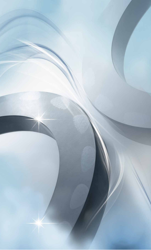
DiamondFace-bonded seal faces with bi-directional gas grooves of a DF(P)DGS6 seal for pumps

Standby: The conditions are similar. The seals are also often left sitting idle for months without flushing. It has been shown that deposits collecting on the seal faces and around the seal during standby in turn have negative effects on the seal compartment.