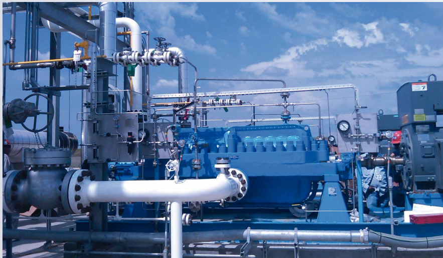
Sulzer ethane pump in an NGL fractionation facility in Houston, Texas. The pump and seal have been running without interruption since conversion to the innovative EagleBurgmann DF-DGS6 sealing solution in 2011.

Keeping NGL (Natural Gas Liquid) pipeline components operating in optimal condition is an ongoing challenge for the oil and gas industry. Rising temperatures in the liquid pumps and the resulting issues for their seals represent one such challenge.